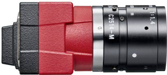
Model without hardware options